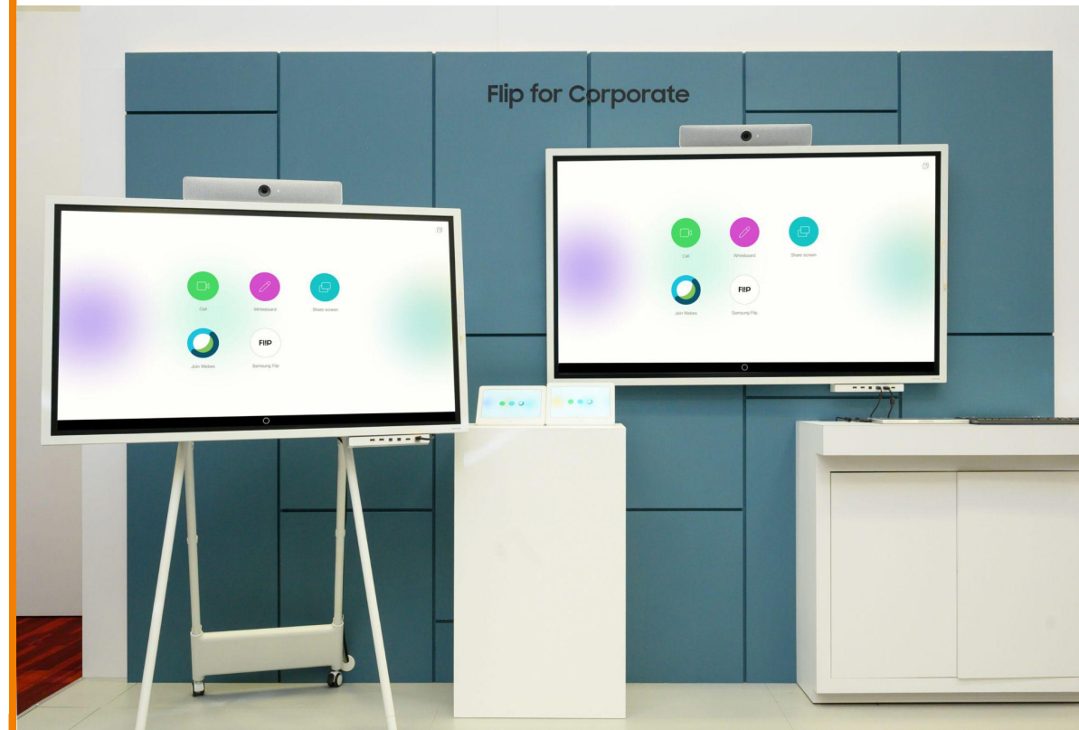
SAMSUNG FLIP 2 Digitales Whiteboard MANUAL