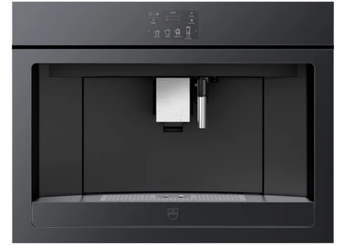
VZUG COFFEE MACHINE. MANUAL