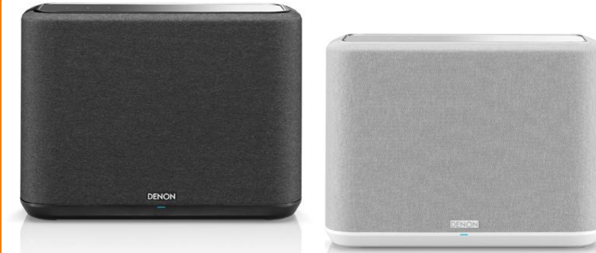
DENON HOME 250 SPEAKER INCL MANUAL