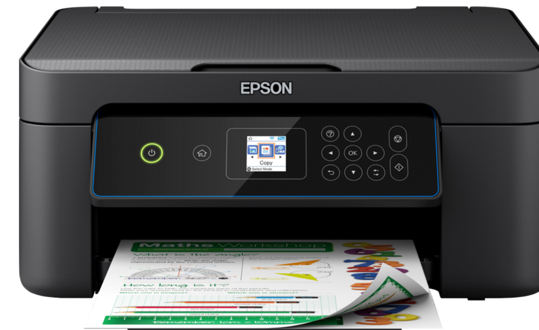
EPSON XP 3155 Color Printer A4 MANUAL