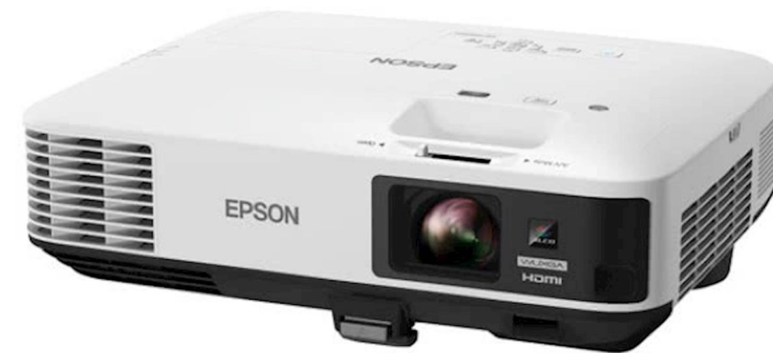
EPSON DAYLIGHT BEAMER MANUAL